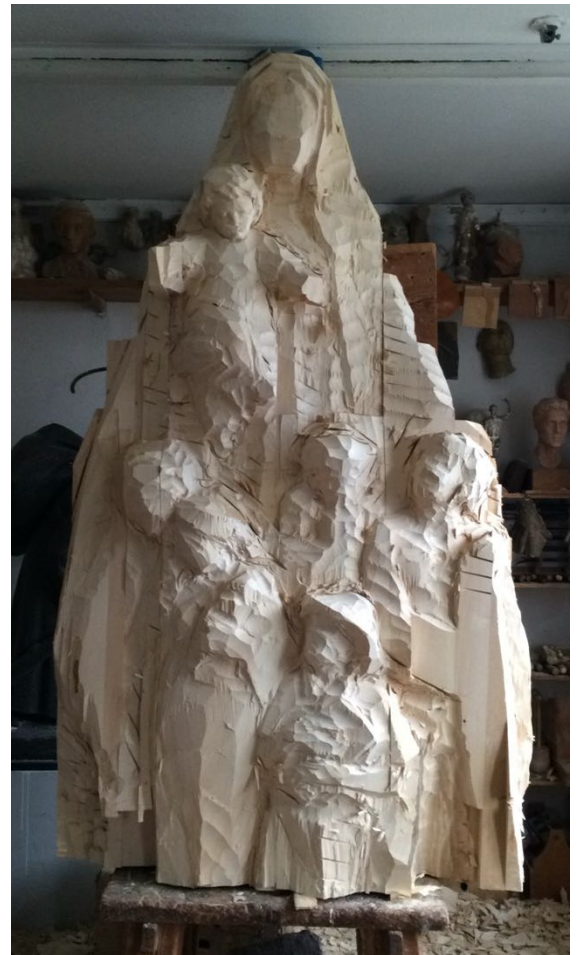
The very early stages of the sculpturing process