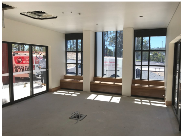
The Board Room