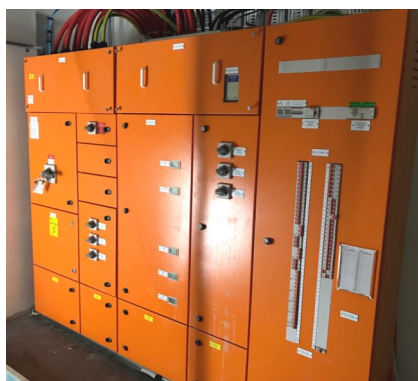
Photo shows the Electrical Distribution board housed in the plant room