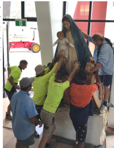
Installing Mary, Mother of Mercy statue last Friday.

After Mass, we return to the Multipurpose facility for refreshments. Shuttle bus will assist those requiring it to return to the school car park. An announcement will be made as to when the bus to the various churches will depart.