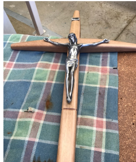
Processional cross in the workshop nearing completion. Thank you to our donors.

With these thoughts in mind let us support the final four weeks of our appeal with patience and pride in what we are contributing and achieving towards God's plan. Please keep our Appeal brochures, and envelopes prominent on the seats and in our Churches and tell visitors, friends and family about our new Church. If you have not yet made a gift to our Appeal, items where we are undersubscribed are our beautiful Mary, Mother of Mercy Statue, our pews, our Organ, and our First Peoples tribute artwork. We invite you to pray about our Parish future and ask if you can yet help our project and our appeal in any way.