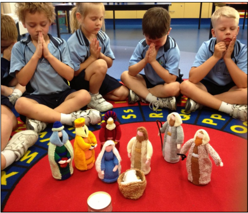
Prayer—Prep students in their prayer circle reflecting on the birth of Baby Jesus with Nativity Set and Candle.