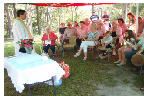
At Tallebudgera - All Souls Day 2010