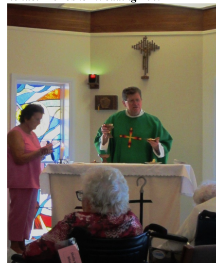
Celebrating the Liturgy of the Eucharist 2 with the Ozanam Villa Residents 2012