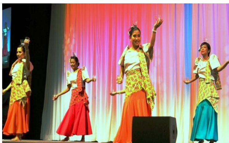
Above: The Catholic Filipino Australian Chaplaincy Gold Coast Dancers entertaining through traditional dance.