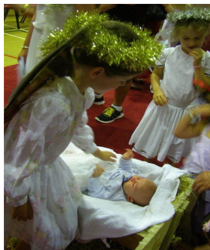
Christmas at the Doyle Centre 2011

This is a time for all of us to reflect on our lives. To forge new pathways and seek prayer for peace in ourselves and for the world.