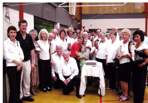
Celebrating with the Choir their 10 year Anniversary 2010