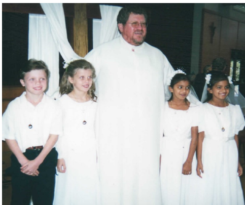
First Eucharist in 2000