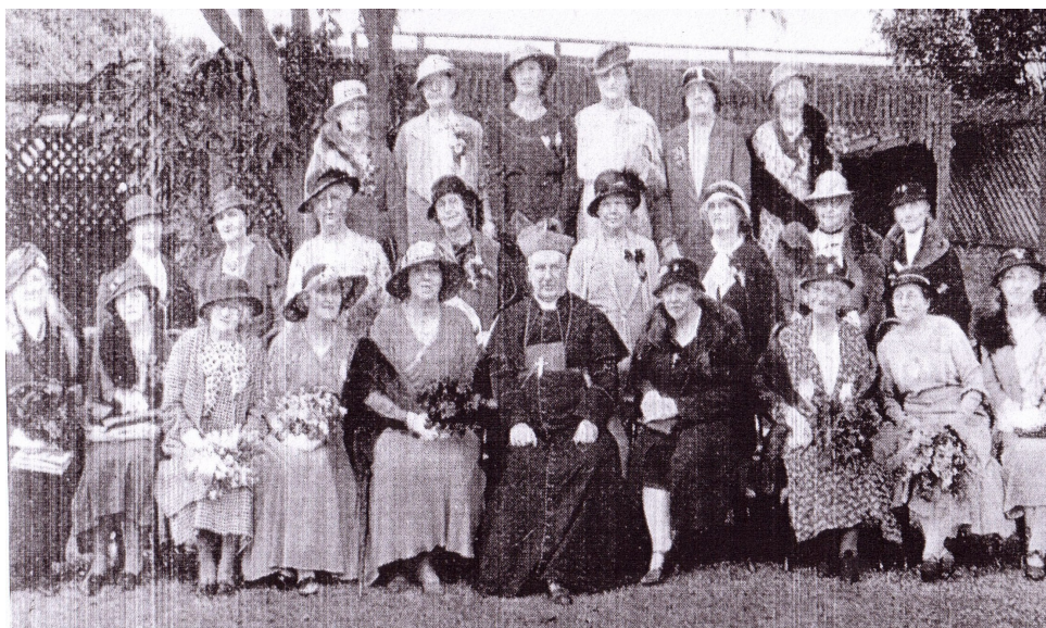
Pictured: Archbishop Duhig and CWL Ladies celebrating Mass at the cathedral.

Included in the aims and objectives of these first Catholic Daughters of Australia, were the meeting of female Catholic immigrants on their arrival, help in seeking employment, and the provision of hostels; assistance to His Grace, the Archbishop of Brisbane with the Cathedral