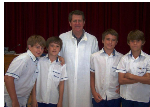
Students of Marymount