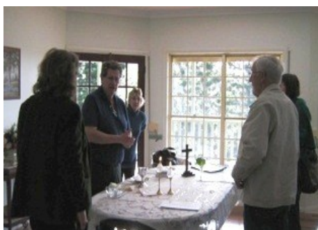
Liturgy with the Springbrook Community

"If the Catholics of the Gold Coast and of Infant Saviour Parish Burleigh Heads can rise to greet each Sunday as a feast of Easter and each dawn as a promise of the resurrection, this will ensure that our best days are always ahead of us and it will never be able to be said convincingly that the coast or its Catholics have had it."