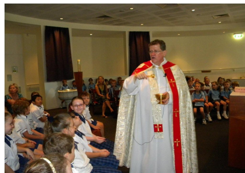
Liturgy with the Marymount Primary children.