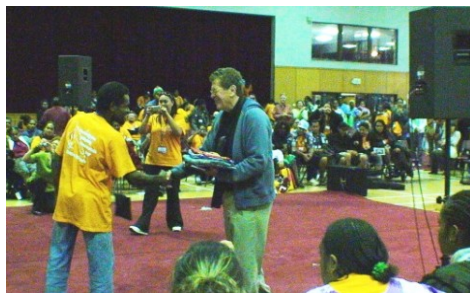
Burleigh Heads hosted WYD participants from New Caledonia and New Guinea 2009