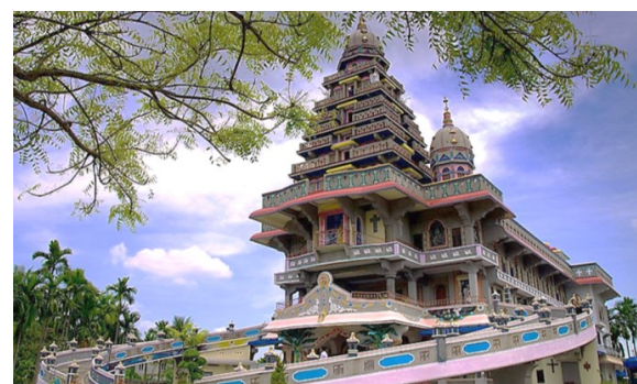
The Marian shrine of Annai Velangkanni. Medan, Indonesia

God, our Sustainer, we praise you for your loving kindness, for upholding us in times of trial, and showing us your light in times of darkness. Transform our lives so that we may be a blessing for others. Help us to live unity in diversity as a witness to your communion, Father, Son and Holy Spirit, one God, now and forever. Amen