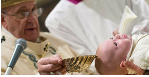
Pope Francis welcomes a baby into the Catholic faith through baptism