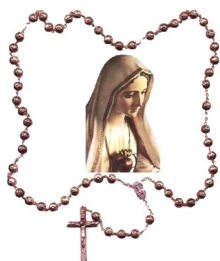
Archbishop of Brisbane 9 October 2018

To celebrate the end of the Rosary month of October, an invitation is extended to visit Marian Valley, Canungra, on Saturday 27 October.